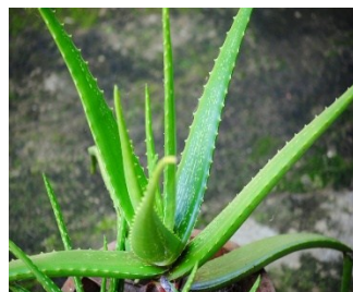
Fig- 2 Aloe Vera