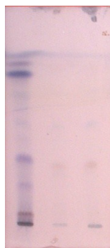
Fig- 5 HPTLC finger print of herbs used in Evefresh Cream after derivatization Lane 1- Curcuma zedoaria; Lane 2- Aloe Vera; Lane 3 –Evefresh Cream